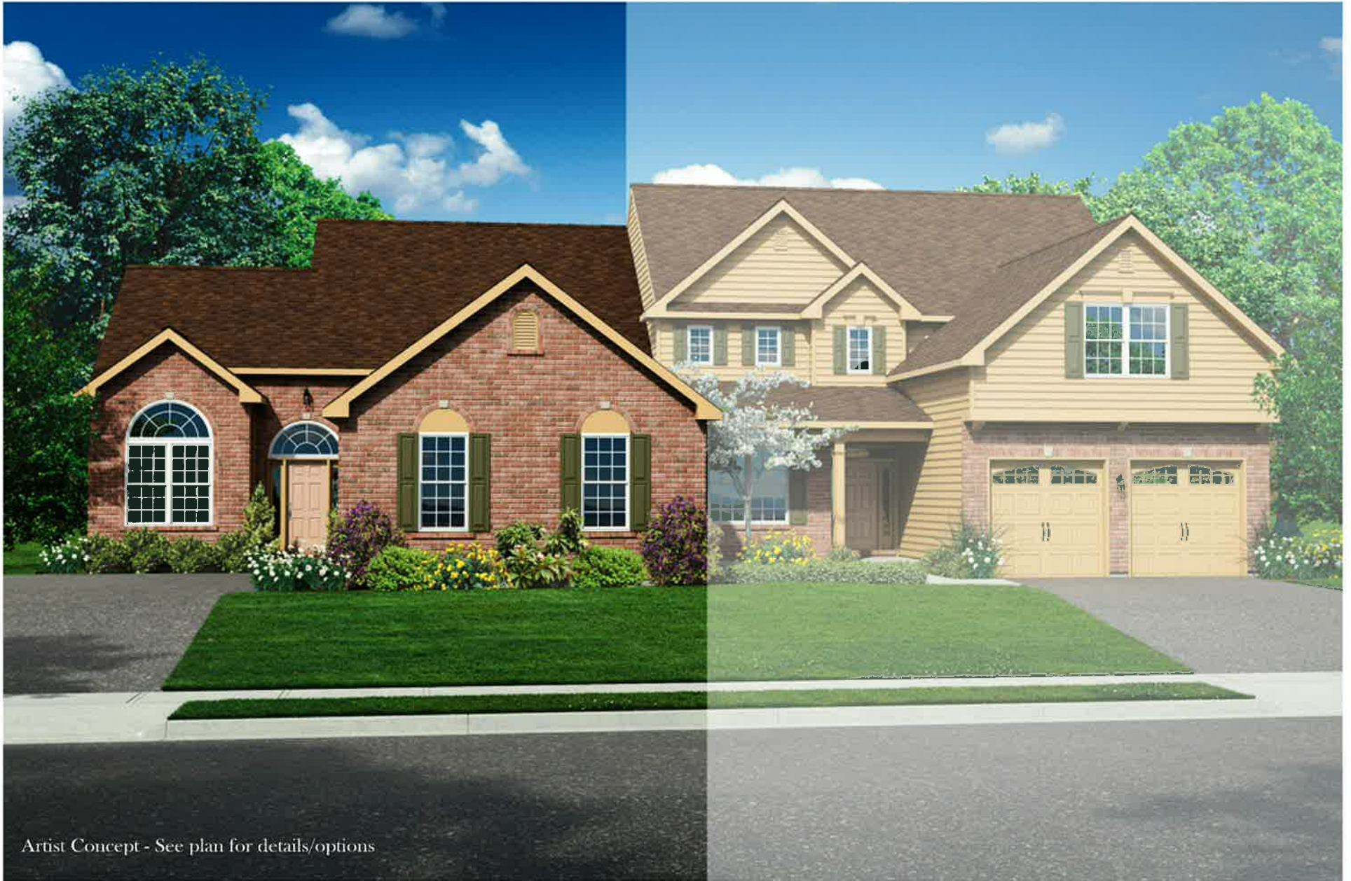
Artist Concept - See plan for details/options