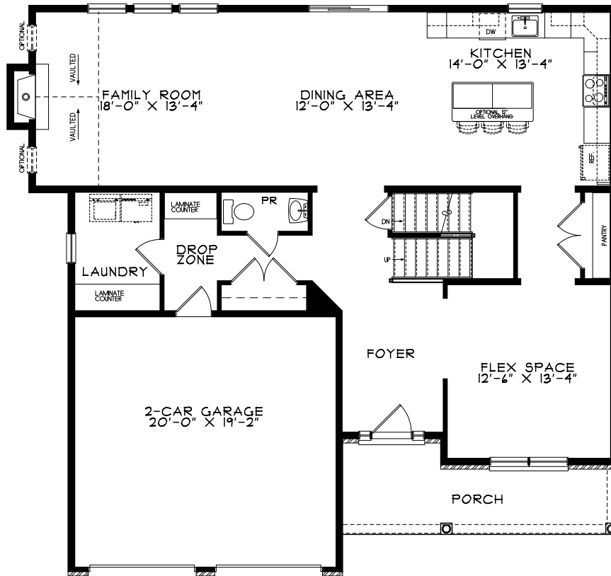
RAINIER FIRST FLOOR PLAN 1,279sf