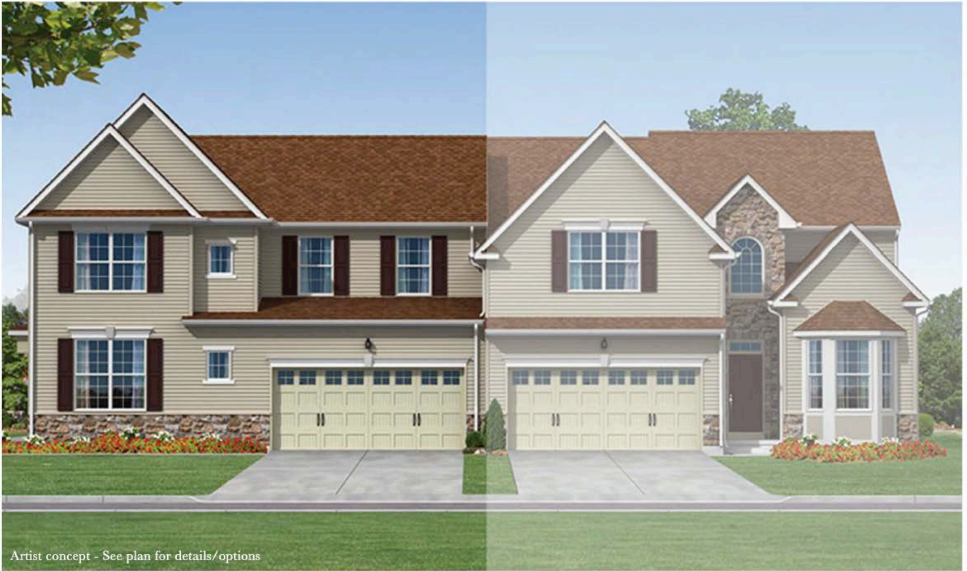
Artist concept - See plan for details/options