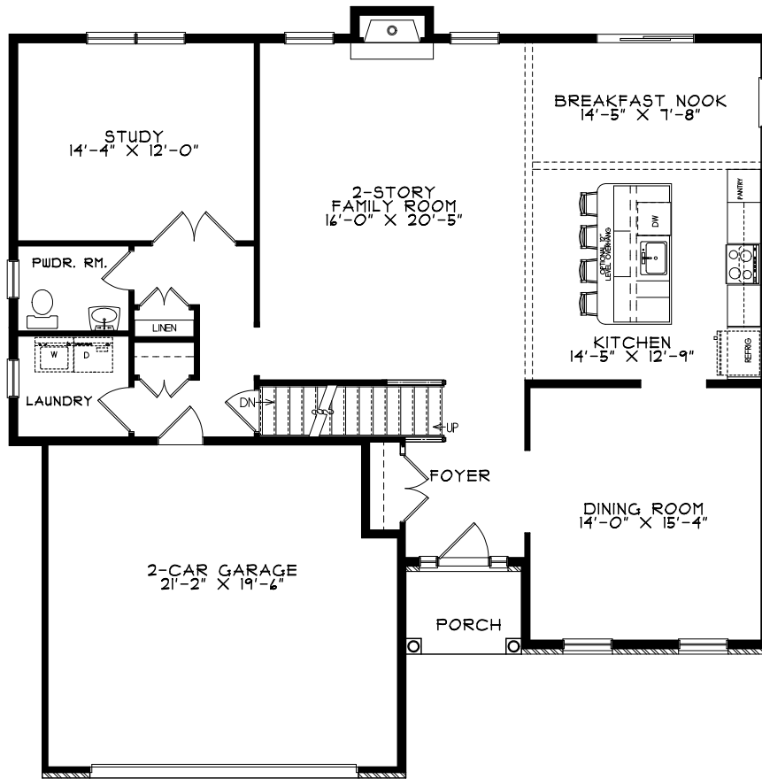
YELLOWSTONE FIRST FLOOR PLAN 1,415sf